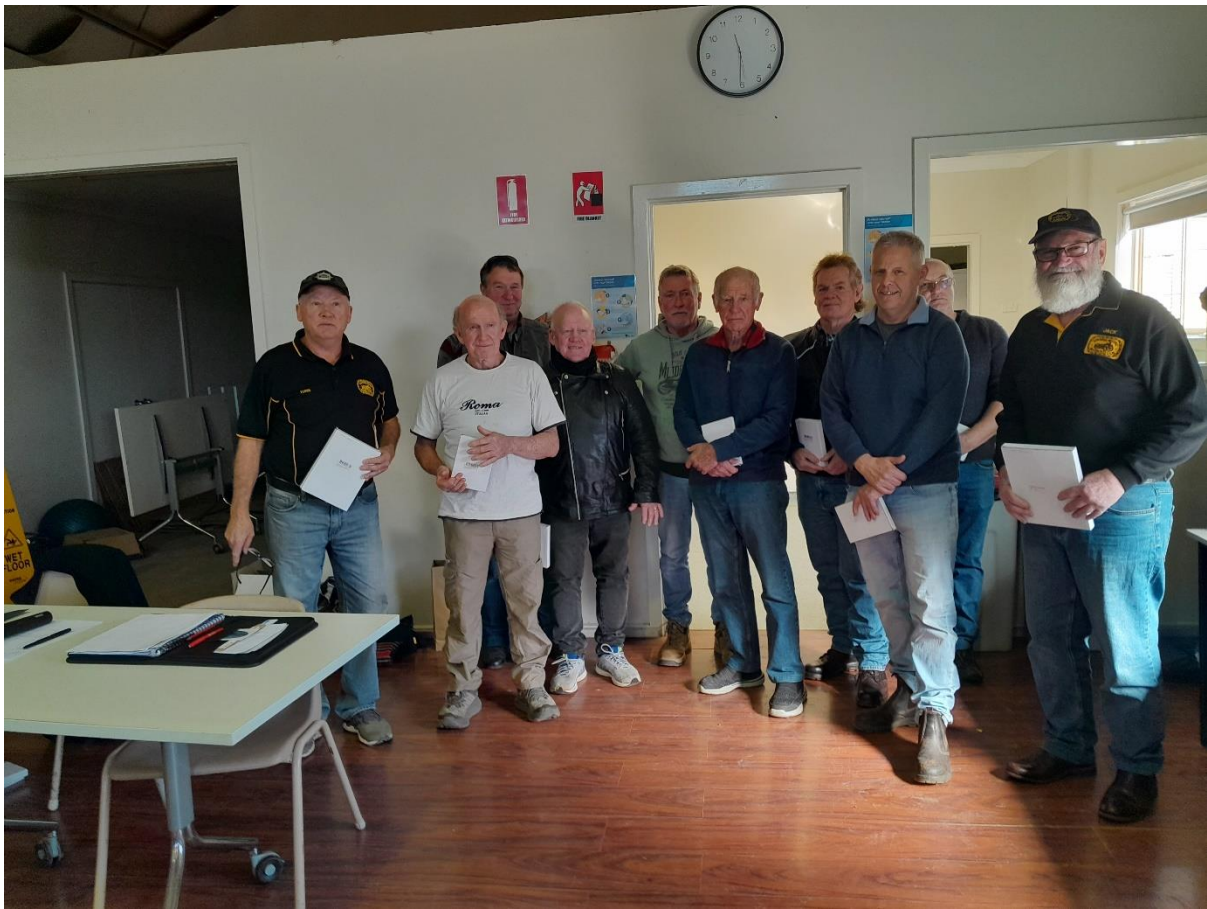
Members receiving their Membership awards.