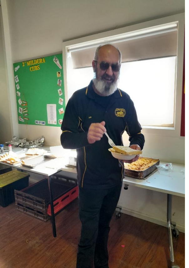
Members enjoying the food, the socialising and the sunshine after the AGM